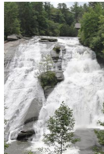
Twin Falls, Dupont Forest

Also within Pisgah is the Cradle of Forestry that tells the story of the first school of forestry by George Vanderbilt who owned all the land from Biltmore to what is now Pisgah National Forest. Continue to drive further and you will come upon the Pisgah Inn with its magnificent views and glorious entrance to the Blue Ridge Parkway.