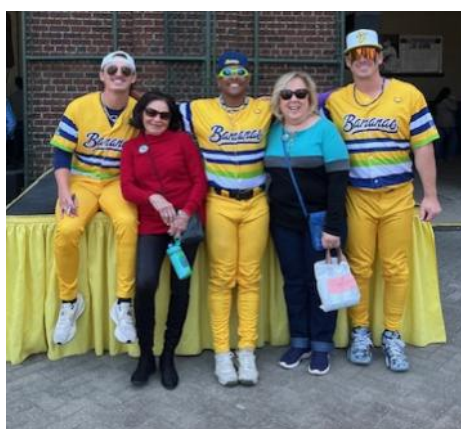
Travel Club Members had a fun day enjoying a Savannah Bananas game.

Come starting at 12:30 to see what events others are planning to attend.